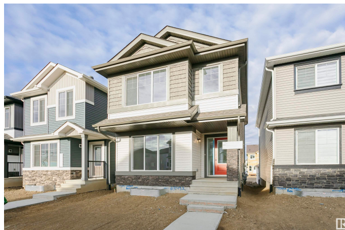
9564 Carson Bend SW, Edmonton, AB

Main Floor Exterior Area 74.83 m 2 Interior Area 68.68 m 2