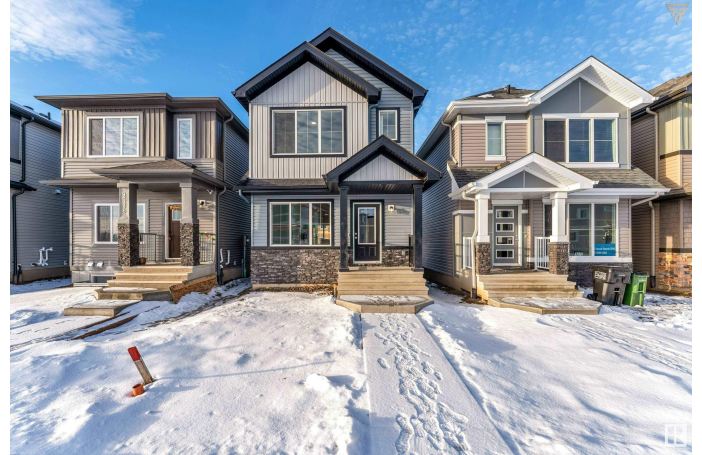
9574 Carson Bnd SW, Edmonton, AB

MLS® # E4416797 Price $485,000 Bedrooms 3 Bathrooms 2.50