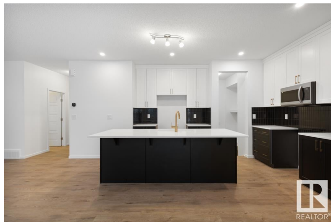
37484026 – Interior Selection Photo – Main Floor

MLS® # E4428135 Price $647,990 Bedrooms 4